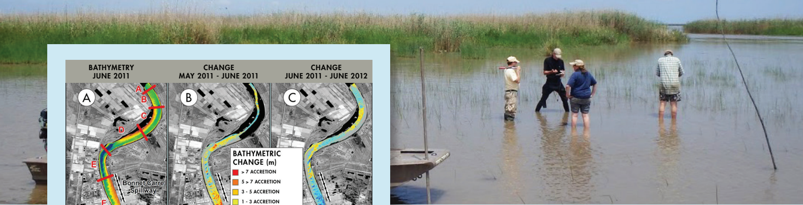
Above: the Institute teamed with the Army Corps of Engineers to combine mobile SEDFLUME measurements of sediment erodibility with a number of the Institute's field measurements of sediment strength in Fort St. Philip.